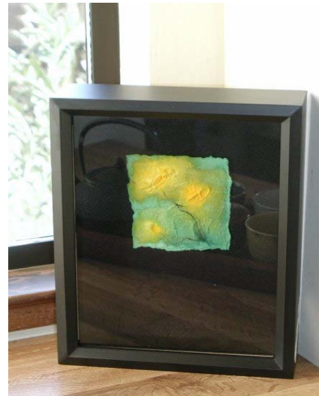
Sun-washed Buttercups ~ W.Azure © 2005

That fabulous pair of redwoods from my home's picture window inspired yet another of my paintings.