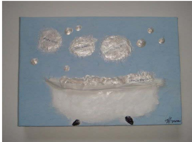
Bubble Bath Respite ~ W.Azure © 2006

...Make love. Take a bath. Make love again. This delightful quote is by Frida Kahlo, an artist who dealt with decades of physical pain. The words burst the soap bubbles—like the relief and joy you can feel during a luxurious bath. What a fabulous idea to be able to take a break from one pleasurable activity by doing another pleasurable activity. This art piece was in the Ode to Love: Venus & Cupid exhibit at Aurora Colors Gallery in Petaluma, CA.