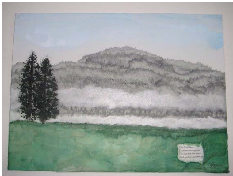
Petaluma Morning Mist

...Make love. Take a bath. Make love again. This delightful quote is by Frida Kahlo, an artist who dealt with decades of physical pain. The words burst the soap bubbles—like the relief and joy you can feel during a luxurious bath. What a fabulous idea to be able to take a break from one pleasurable activity by doing another pleasurable activity. This art piece was in the Ode to Love: Venus & Cupid exhibit at Aurora Colors Gallery in Petaluma, CA.