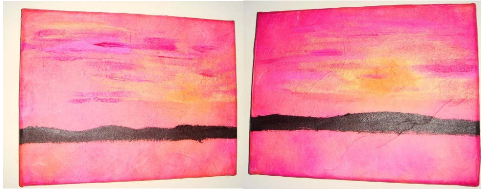
Kenbrah's Twin Hot Pink Sunsets ~ W.Azure © 2007