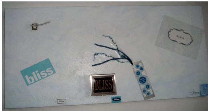
Bliss ~ W.Azure © 2006

Includes a StarStruck compact that you can open to peek at what's inside, refrigerator magnet, cards from a www.blissworld.com order, Twig (RIP) sterling silver picture frame charm: "Picture yourself a life of bliss," Dauphine Press letterpress'd card, bookmark: "Follow your bliss. ~Joseph Campbell."