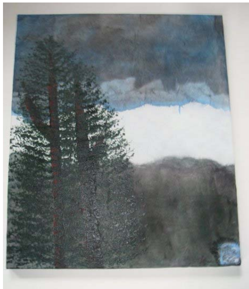
Stalwart Soulmates ~ W.Azure © 2006

The mountains surrounding Petaluma, azure blue sky, and occasional glorious fog continue to catch my breath while I gratefully acknowledge how happy I am to be alive.