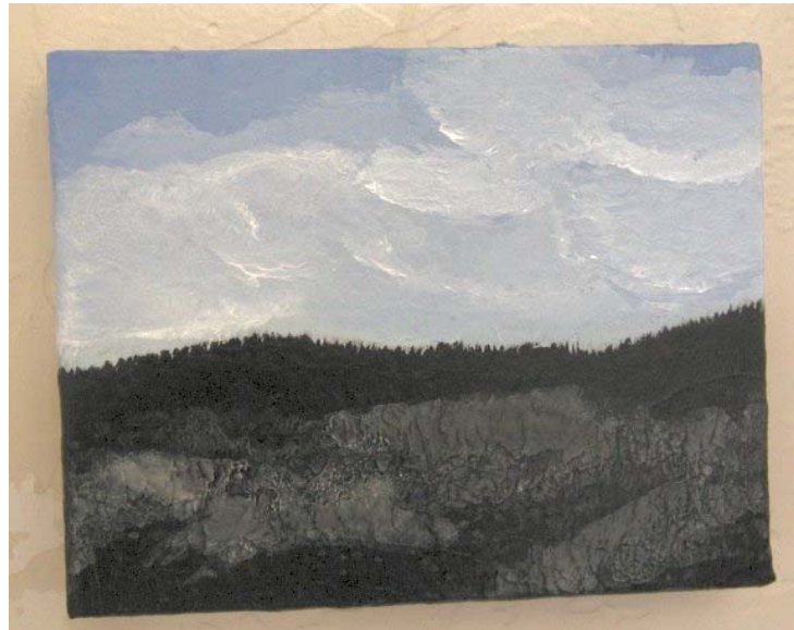
Misty Mountain Hop ~ W.Azure © 2005

The mountains surrounding Petaluma, azure blue sky, and occasional glorious fog continue to catch my breath while I gratefully acknowledge how happy I am to be alive.